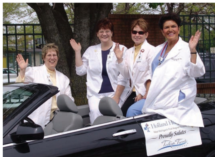
Holland Hospital nurses celebrate our Magnet designation at the Tulip Time Festival.